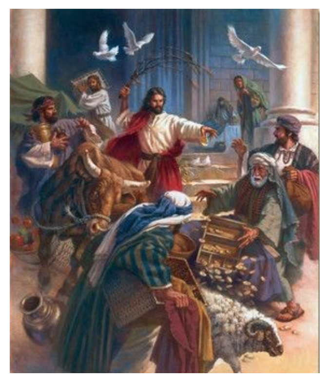
The Third Sunday of Lent March 4, 2018

Monday through Thursday : 9am to 9pm Friday: 9am to 6pm Saturday: 8:30am to Noon Sunday: 8:30am to 1pm Priests are available after office hours for emergencies only by calling 215.368.0220.