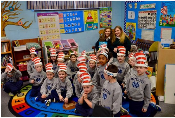
Mater Dei students enjoyed "Read Across America Day" 2018 with Lansdale Catholic students!

For information about Mater Dei Catholic School call 215.368.0995, email info@materdeicatholic.com or visit www.materdeicatholic.com .