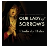
Our Lady of Sorrows In LISTEN: Talks/Discover the Saints

Register today: Go to formed.org , click on “Register” & enter our parish code ZR6M2C . You’ll be asked to enter a user name for yourself and create a password. In the future, just log in with your user name & password. To easily locate the content you wish to view, click on “Content List” at the bottom of the Home Page.