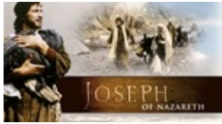
Joseph of Nazareth In WATCH: Movies/Saints of History

Recommended this week: As we draw near to Holy Week, turn to St. Joseph and Our Lady to help you renew your Lenten devotions and draw closer to their Son. Try a family movie night!