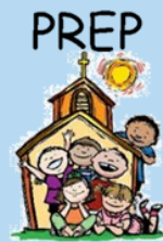
Parish Religious Education Program

SACRAMENT NOTES: The children will be prepared to receive the sacraments of Reconciliation and Eucharist for the first time in 2nd grade. It is a two-year preparation process. Children who are older than 2nd grade, and who have not yet received these sacraments, are encouraged to register as soon as possible. We will evaluate the best placement for them based upon classes available. The sacrament of Confirmation is conferred in 7th grade ( or older, depending on when you begin the preparation process ).