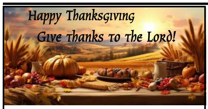
Join us for daily Mass on Thursday at 9am