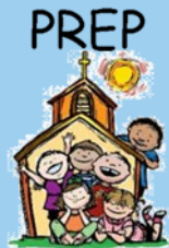
Parish Religious Education Program

SACRAMENT NOTES: The children will be prepared to receive the sacraments of Reconciliation and Eucharist for the first time in 2nd grade. This is a two-year preparation process. Religious Education continues yearly after First Communion through 7th grade, when the students will receive the sacrament of Confirmation (or possibly older, depending on when they began the preparation process). Children who are older than 2nd grade, and who have not yet received their First Communion, are encouraged to register as soon as possible. We will evaluate the best placement for them based upon classes available.