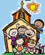
Parish Religious Education Program

WHO: Public & Private (non-Catholic) School Children in grades Pre-K and above (Note: First Communion is usually received in 2nd grade and Confirmation in 7th grade; however, we will gladly welcome your child if he/she is older and has not yet received these sacraments. Please contact us so that we may prepare a plan for their faith formation.)